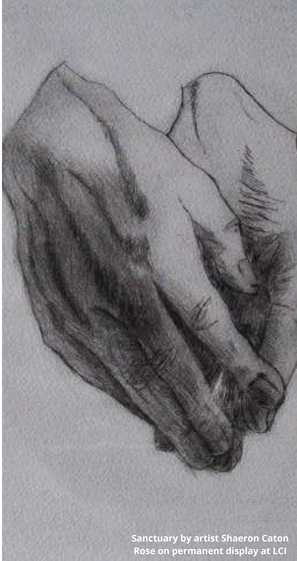
Sanctuary by artist Shaeron Caton Rose on permanent display at LCI