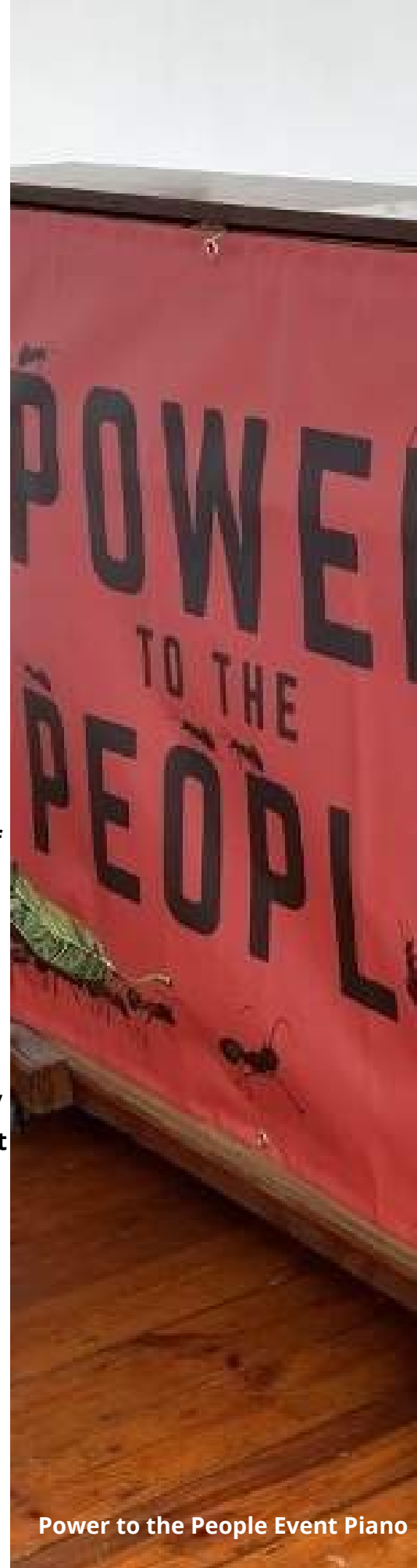
Power to the People Event Piano

The House of Questions Exhibition (from the 2020 Bursary) was hosted by Epiphany Church Gipton, and a second Theology and Arts Bursary ran in 2021.