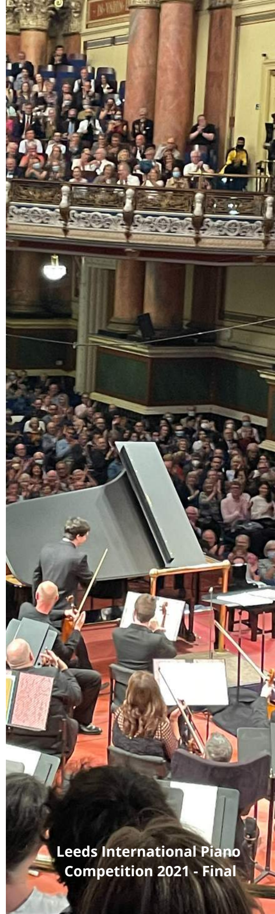
Leeds International Piano Competition 2021 - Final

The number of subscribers and followers across all social channels has increased significantly, representing new ways of digital engagement