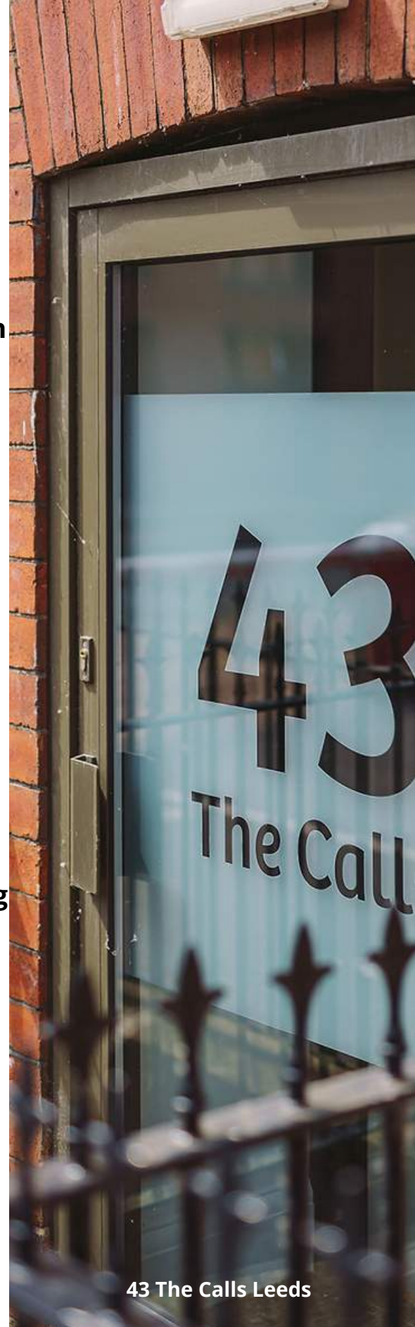
43 The Calls Leeds

In June, LCI signed a five year lease on the Lower Ground level of 43 The Calls, Leeds, LS2 7EY. The premises is equipped to be a place of work, meeting and partnership shared with Leeds Sanctuary and Leeds Citizens. Staff began to work from the premises as covid-related restrictions allowed.