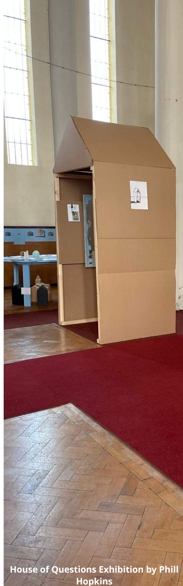
House of Questions Exhibition by Phill Hopkins